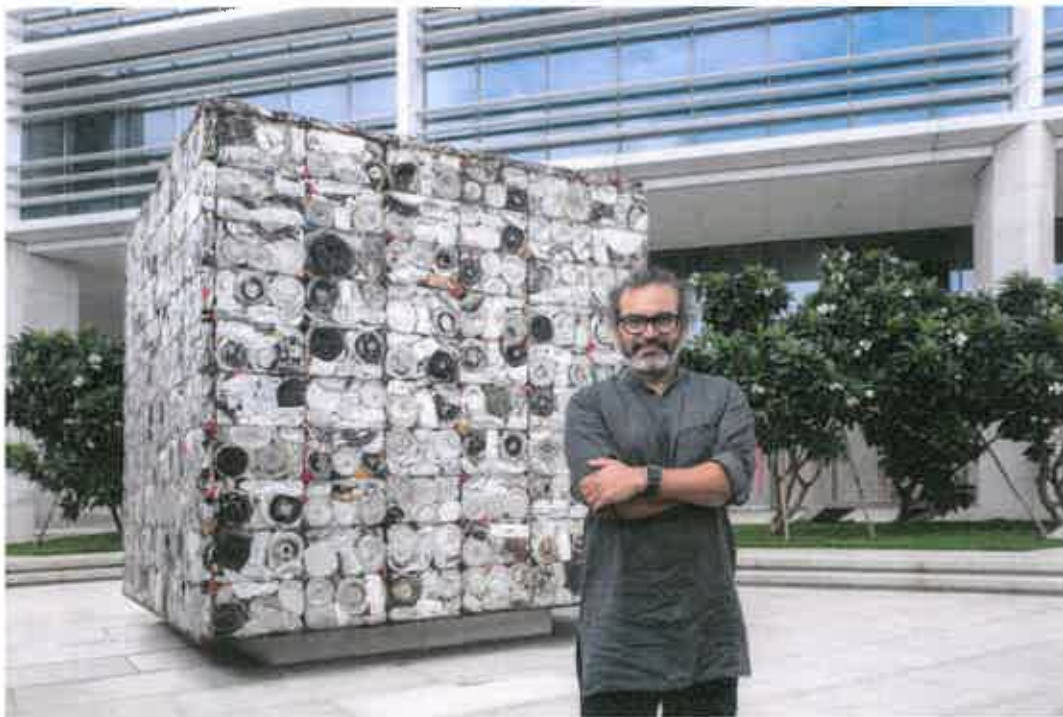
Subodh Gupta with his artwork "Aakash, Pataal, Dharti" at Godrej BKC