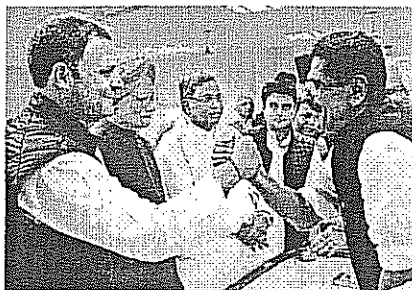
(From left) Congress Vice-President Rahul Gandhi and Former Prime Minister Manmohan Singh with party colleagues at the AICC office in Delhi on Monday

As President, Rahul is already placing his team in place, but without pain to the old guard. Ghulam Nabi Azad, Ashok Gehlot and Meera Kumar are expected to play a senior advisory role. Former Prime Minister Manmohan Singh and Finance Minister P Chidambaram are also expected to be advisors. Top Congress sources said the public faces — the general secretaries — were likely to be newer and younger: Millind Deora (ex-MP, Mumbai), Meenakshi Natarajan (ex-MP Mandasaur, Madhya Pradesh), Jitendra Singh (Awar), others who would be a key part of Team Rahul include Sushmita Dev (making the feisty MP the Mahila Congress chief helped revive the staid frontal organi-