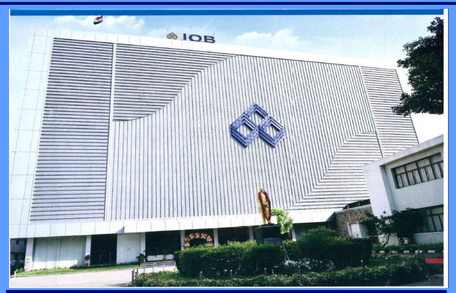
Good People to Grow With