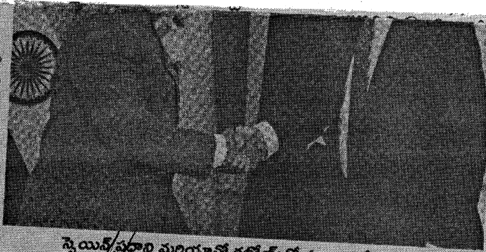
స్వయం ప్రధాని మరియు సో రజోయతో ప్రధాని వరేంద్ర మోదీ

టిఎస్ లిమిటెడ్ స్టాండల్ వన్ నికర నష్టం గత ఆర్థిక సంవత్సరం (2016-17) చివరి త్రైమాసికం (జనవరి-మార్చి)లో 202.51 కోట్ల రూపాయలుగా నమోదైంది. అంతకుముందు ఆర్థిక సంవత్సరం (2015-16) జనవరి-మార్చి త్రైమాసికంలో 15.69 కోట్ల రూపాయల లాభం వచ్చింది. మొత్తం ఆదాయం ఈసారి 24.07 కోట్ల రూపాయలుగా, నిరుడు 698.47 కోట్ల రూపాయలుగా ఉందని సంస్థ వెల్లడించింది.