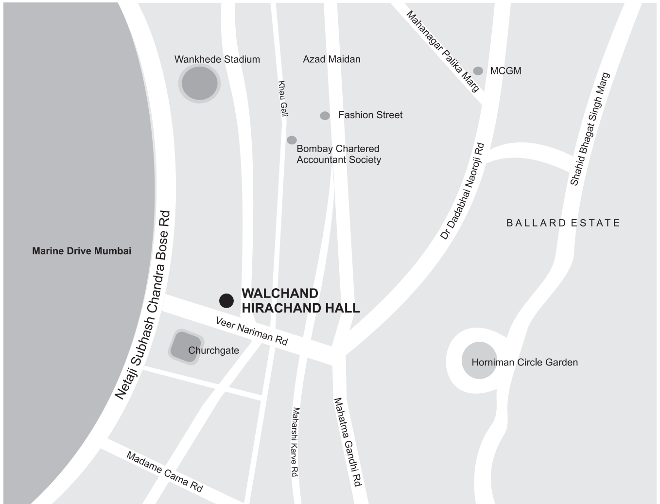
Route Map to the venue of 70 th Annual General Meeting to be held on Friday, June 30, 2017.