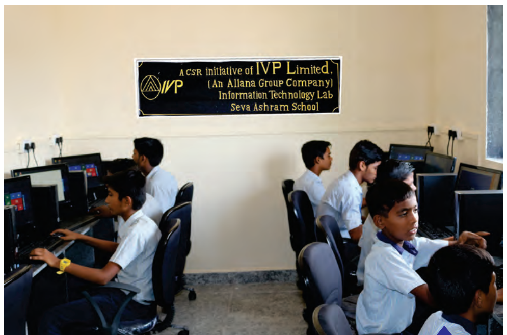
Information Technology Lab