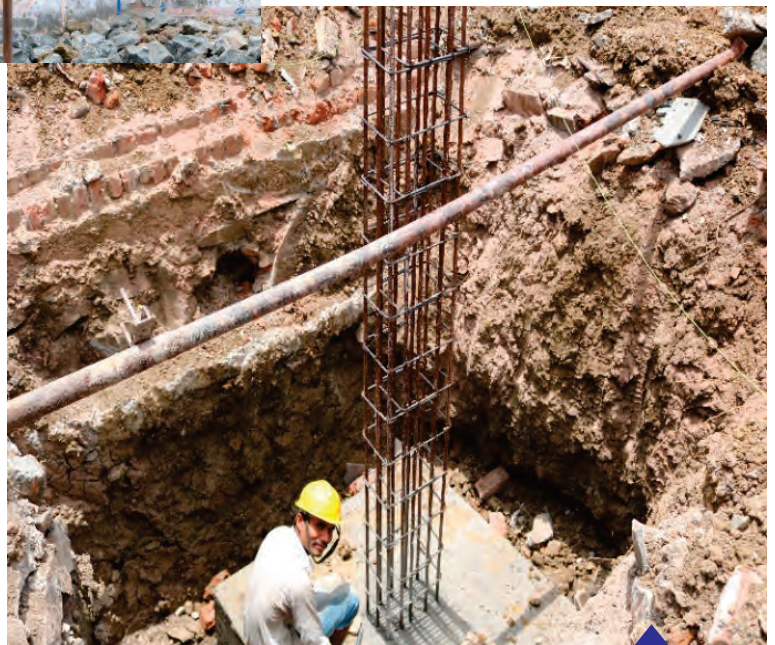
Work in progress for construction of classrooms at Salvad