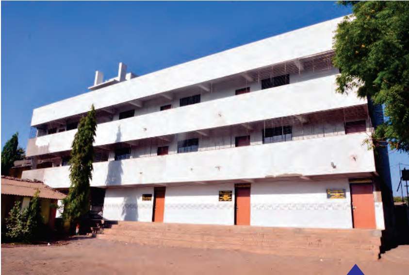
Seva Ashram School at Tarapur

Recognizing that the best way of achieving this is through building a vision for the next generation, we have been focused on providing infrastructure to local primary educational schools to facilitate learning. We have provided classroom infrastructure and information technology laboratory facilities to schools in the communities we operate in.