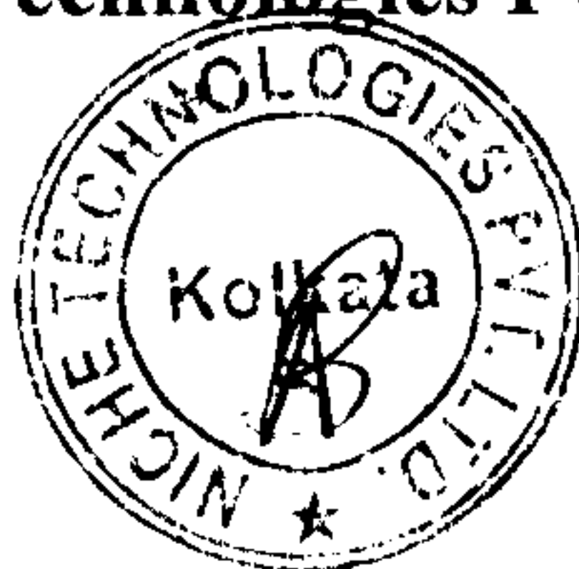
Ashok Sen (Authorised Signatory)