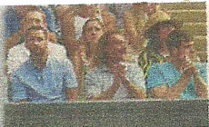
Contrast to the U.S. Open, tennis begin

magnified by 10 that it was a bit to block out, and, Petchey