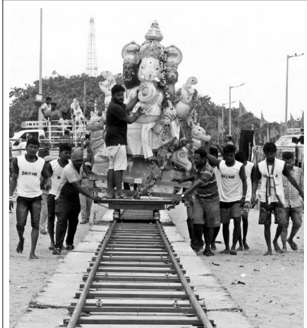
For the first time in Chennai, the Ganesha idols that were placed in various parts of the city for Vinayagar Chaturthi festival were immersed in Pattinapakkam with the help of trolleys.