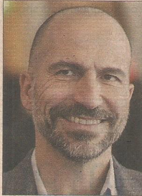
Since taking over last summer, the CEO has been on a charm offensive to improve Uber's image after a series of controversies led to the ouster of his predecessor

Since taking over last summer, the CEO has been on a charm offensive to improve Uber's image after a series of controversies that led to the ouster of his predecessor, Travis Kalanick. Khosrowshahi