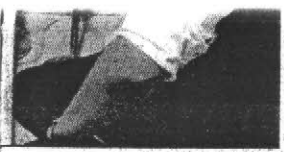
ନେତା ହାର୍ଡିକ ପଟେଲ ଭେଟୁଛନ୍ତି ।