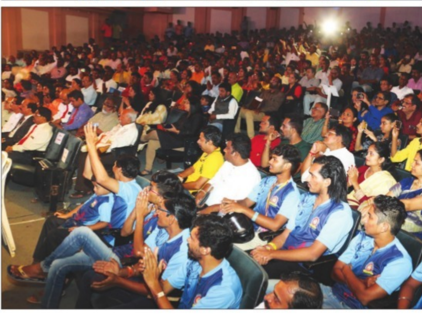
गणेशोत्सव मंडळासाठी ‘लोकसत्ता’ने आयोजित केलेल्या ‘मुंबईचा राजा कोण?’ या स्पर्धेचे पारितोषिक वितरण गुरुवारी सायंकाळी रवींद्र नाट्य मंदिरात उत्साहात पार पडले.