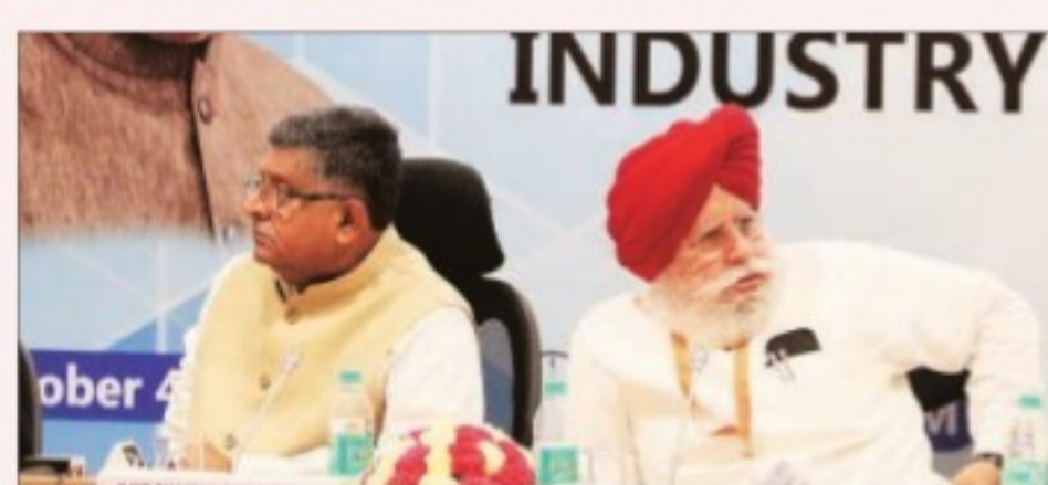
Union IT minister Ravi Shankar Prasad and MoS for IT SS Ahluwalia during a meeting with industry leaders in New Delhi on Thursday

Emerging from the meeting with IT industry leaders, Prasad said companies in the technology and electronics domain have vowed to come together for "social action", and ideas thrown up during the brainstorming session include volunteering for social cause, and a