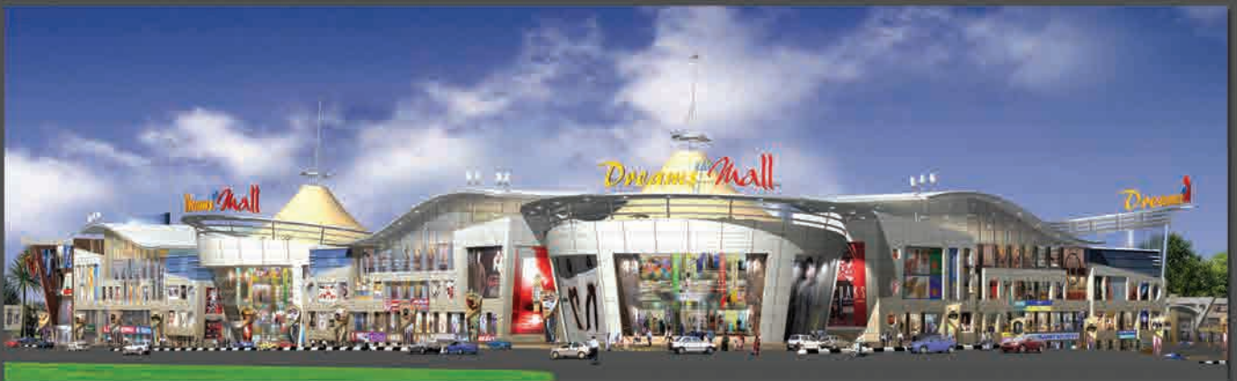
Dreams the Mall - Bhandup