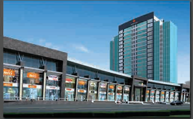
Satra Plaza - Vashi