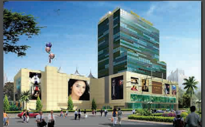
Satra Galleria - Calicut