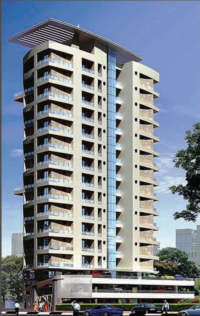
Satra Residency - Khar

Our array of Completed Projects across India