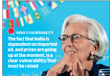
INDIA'S VULNERABILITY The fact that India is dependent on imported oil, and prices are going up at the moment, is a clear vulnerability that must be raised