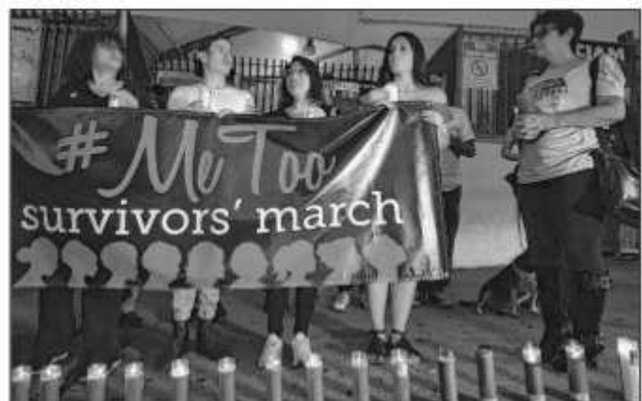
A group describing themselves as #MeToo/YoTambien survivors, hold a candlelight vigil near the Mexico Consulate to support women in the caravan heading through Mexico to the US border, in Los Angeles.