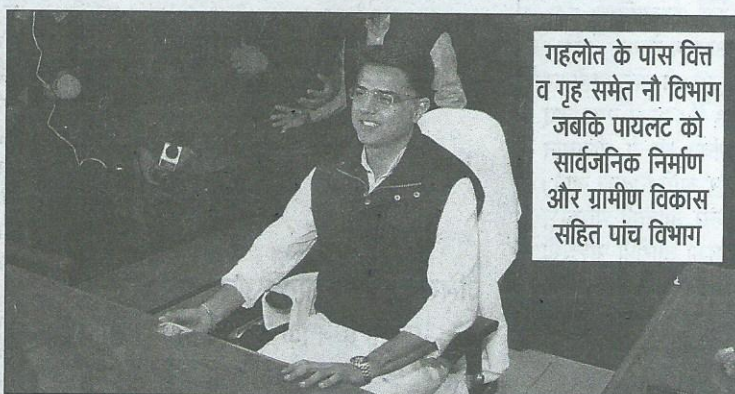
गहलोट के पास वित्त व गृह समेत नौ विभाग जबकि पायलट को सार्वजनिक निर्माण और ग्रामीण विकास सहित पांच विभाग

10 मागों मागों लोत वार भारी के नाने की। मति त्रियों और बाद त ने को मंत्री