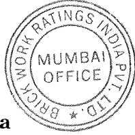
Bala Krishna Piparaiya CGM-Ratings

Note: Rating Rationale of all accepted Ratings are published on Brickwork Ratings website. All non-accepted ratings are also published on Brickwork Ratings web-site . Interested persons are well advised to refer to our website www.brickworkratings.com , If they are unable to view the rationale, they are requested to inform us on brickworkhelp@brickworkratings.com .