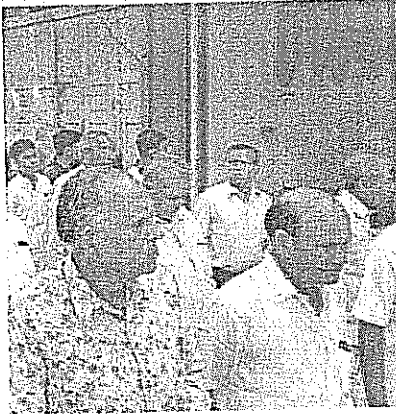
महोत्सव पर शहर में निकाली गई शोभायात्रा।