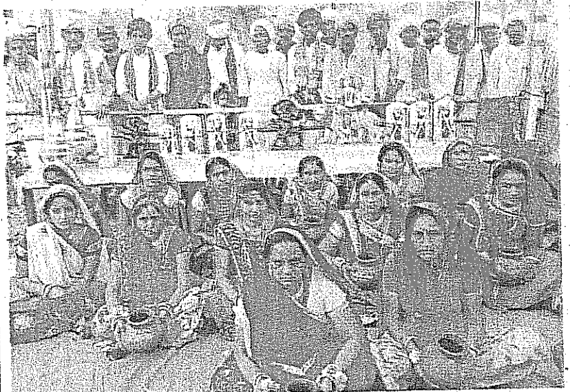
बड़ोदिया. ईटाउवा में प्राण प्रतिष्ठा महोत्सव में मंत्र जाप करते यजमान।