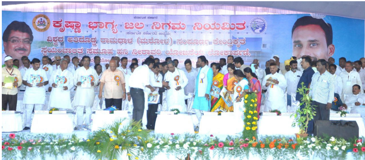
In the picture :- Hon CM of Karnataka Shri Siddaramaiah inaugurating the project by starting pump through Jain IrriCare™ Mobile App.

"This revolutionary project will ensure sustainable farming, as it is technically feasible, economically viable, socially acceptable, equitable and environmentally balanced solution".