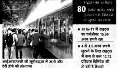
आईआरसीटी की सूचीबद्धता में अभी और तेजी देनी का संभावना

55 करोड़ देना में 80 हजार करोड़ रुपये 2016-17 में जारी सूची के तहत