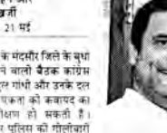
6 जून को मंदसौर में राहुल की राह खुलने लगती है