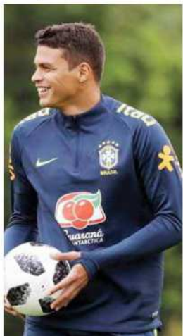
Brazil's Thiago Silva during a training session for the Brazil national team in London.

The team will then travel to Vienna to play their last pre-World Cup friendly against Austria.