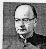
In a Facebook post, Jaitley termed the pre-GST indirect tax regime, during which most of the household items attracted a levy of 31 per cent, "Congress Legacy Tax"

Union Minister Arun Jaitley exuded confidence that GST rates on cement, ACs and televisions will be cut as tax revenues increase, and only luxury and sin goods will attract the highest slab of 28 per cent.