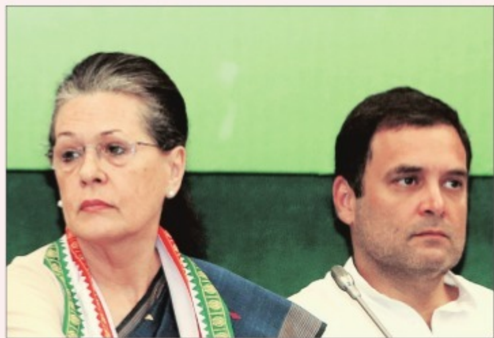
Sonia Gandhi and Rahul Gandhi at the meeting of the newly-constituted CWC on Sunday

The decision was taken at a meeting of the newly-constituted Congress Working Committee (CWC), Pradesh Congress Committee presidents and Congress Legislature Party (CLP) leaders from various states.