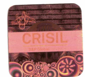
R. Vasudevan Business Head CRISIL SME Ratings

The rating MSE 2 indicates `High credit worthiness in relation to other MSEs`..