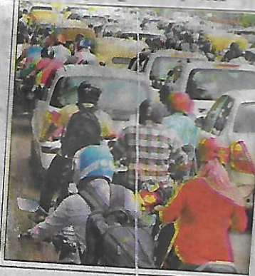
हरिभूमि न्यूज नई दिल्ली

सोमवार रात आई मारी बारिश ने एक बार फिर सिविक एजेंसियों की पोल खोल दी। राजधानी के ज्यादातर सड़कें दोपहर तक जलमग्न रही। ज्यादातर मुख्य मार्गों पर जाम की शिकायतें यातायात पुलिस को मिली। कई जगह पेड़ भी गिरे जो जा का कारण बने। लोगों को दूध पत्तन पहुंचने में भी व के कारण देरी हुई। उत्तम नगर, धीला कुआँ और आरके पुरम में जलमग्न से ट्रैफिक जाम की शिकायतें मिली। मोती बाग प्लाईओवर के बाँचे दोनों तरफ जलमग्न के कारण यातायात प्रभावित रहा। इसके अलावा मुंडका से राजधानी पार्क के वाले मार्ग पर भी जाम लगा। राजौरी गार्डन से पंजाबी बाग वाले मार्ग पर जलमग्न के चलते की स्थिति बनी रही। देवली और संगम विहार इलाकों में मारी बारिश के बाद हुआ जलमग्न गांगोई-नजफगढ़ रोड पर 2 शयमाता हॉस्पिटल के पास जलमग्न की वजह से यातायात प्रभावित