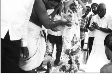
அனைத்தொடர்ந்து கலைகோவில் கோபுர கலசம், அதை தொடர்ந்து மூலவர் செல்வ விநாயகருக்கு மகா கும்பாபிஷேகம் மற்றும் மகா அபிஷேகம், தீபாராதனை நடந்தது.

திருவள்ளூர் அடுத்த கட்டப்பத்தூர் ஒன்றியம் சிற்பம் பக்கம் கிராமத்தில் பழமை வாய்ந்த செல்வ விநாயகர் கோவில் மஹா கும்பாபிஷேகம் சிறப்பாக நடைபெற்றது.