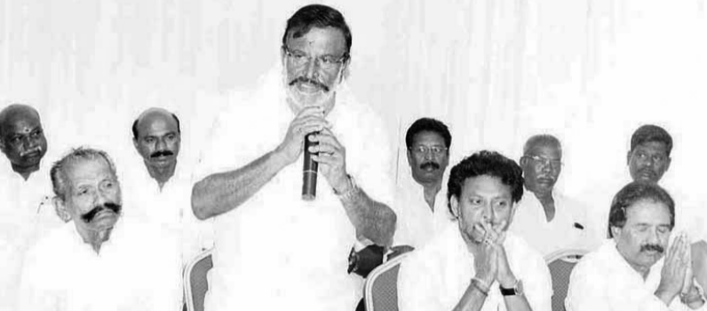
பேன்ற பன்முக தன்மையுடன் விளங்கிய வருமான கருணாநிதி மறைவுக்கு இக்கூட்டத்தில் ஆழ்ந்த இரங்கலை தெரிவித்துக் கொள்கிறது என்றார்.