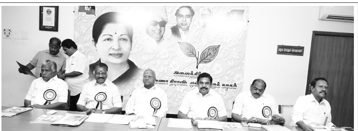
அதிமுக செயற்குழு கூட்டம் கட்சி அவைத்தலைவர் மதுசூதனன் தலைமையில் நடைபெற்றது. இதில் முதல்வர் எடப்பாடி பழனிசாமி, துணைமுதல்வர் ஓ.பன்னீர்செல்வம், துணை ஒருங்கிணைப்பாளர் கே.பி.முனுசாமி, மக்களவை துணை சபாநாயகர் தம்பிதுரை, வைத்தியலிங்கம் எம்.பி. ஆகியோர் பங்கேற்றனர்.

கேள்வி:- அ.தி.மு.க. விண் நாடாளுமன்ற தேர்தல் விடயம் என்னவாக இருக்கும்? பதில்:- ஜெயலலிதாவின் நல்லாட்சி தான் தற்போதும் தொடருகிறது.