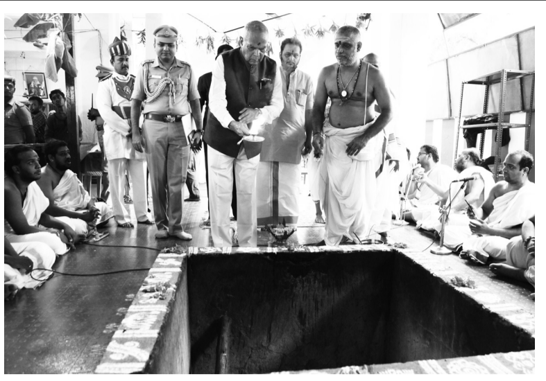
Governor Banwarilal Purohit inaugurating Sri Lakshmi Kubera Homam at Sri Sankara Mutt, West Mambalam in Chennai, today.

The Supreme Court bench made it clear that it would confine itself to the aspect of disaster management and said that the decision to lower the water limit in the dam has been taken in view of the devastating deluge in Kerala. The bench fixed the matter for hearing on 6 September and asked Kerala, Puducherry, Tamilnadu and Karnataka to file their responses in the meantime.