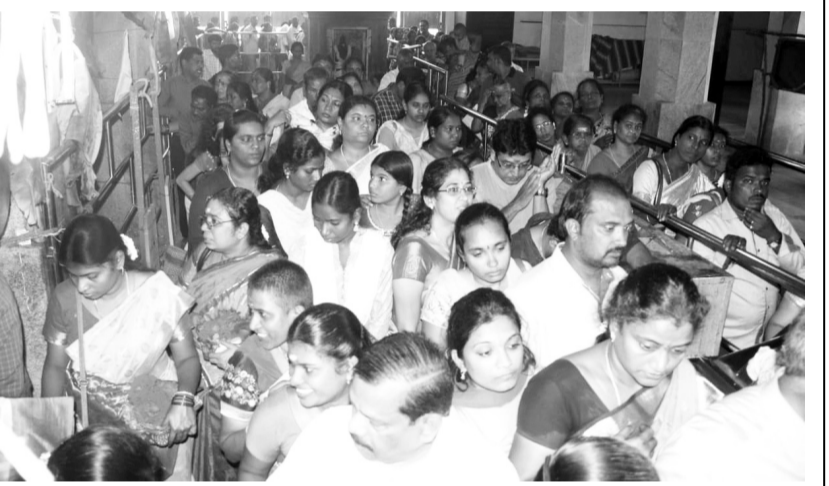
As part of Varalakshmi Viratham, idols of Padmavathy Thayar and Srinivasa Perumal were decked up at Ashtalaksmi Temple, Besant Nagar in Chennai today. Devotees gathered in large numbers to seek blessings.