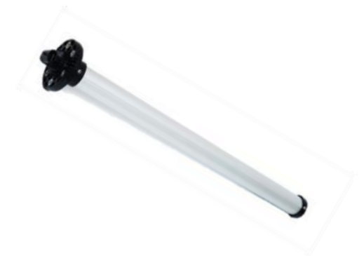
Fuel Level Sensor Non Fuel Contact Type