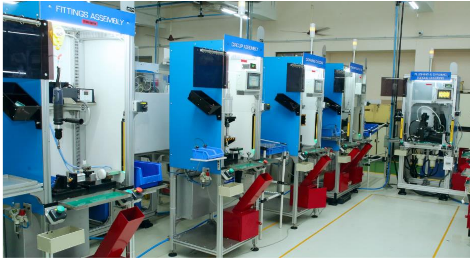
Water Pump Assembly Line in Plant 3 for Harley Davidson