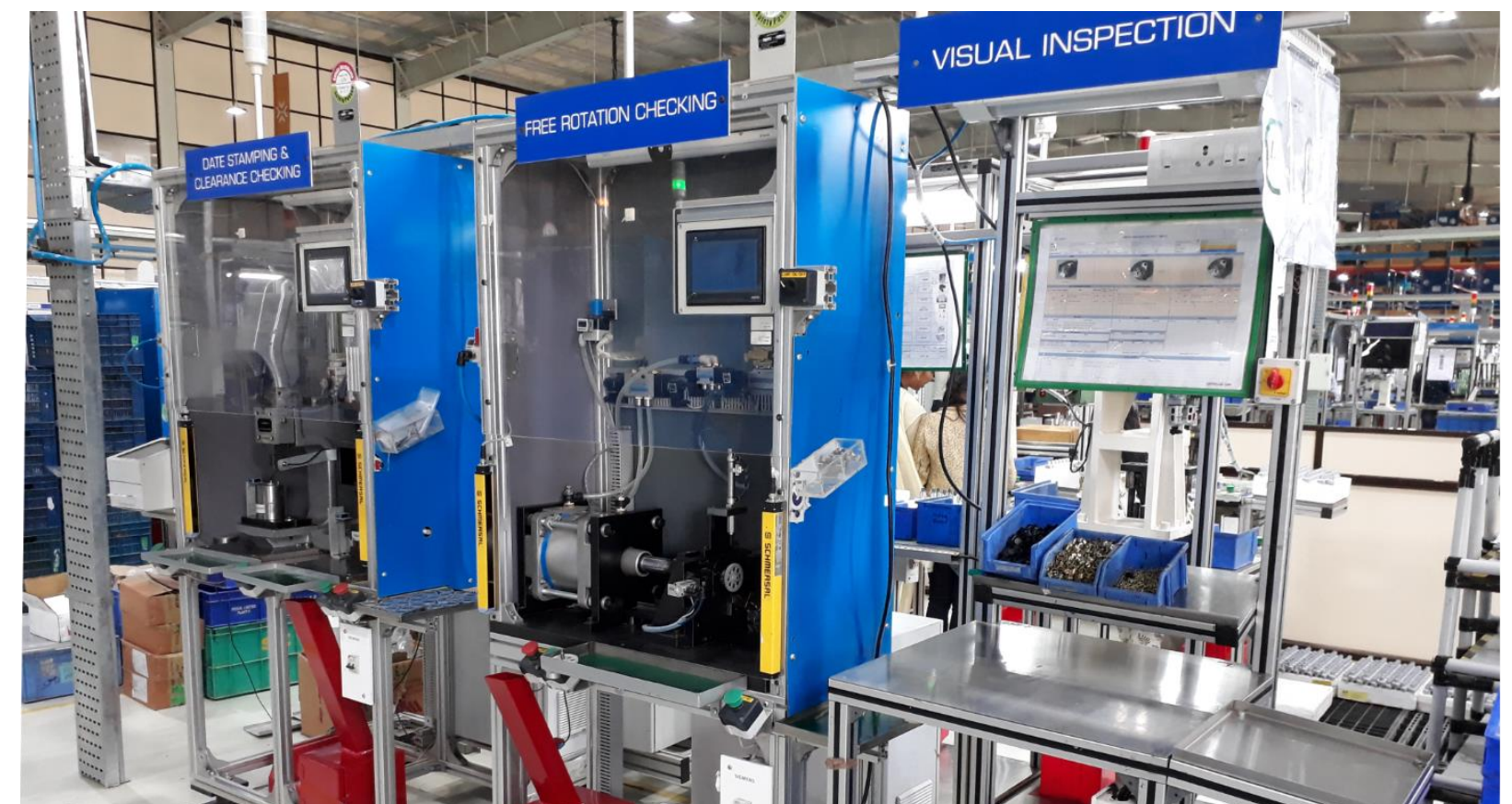
Oil Pump Assembly Line in Plant 3 for Royal Enfield