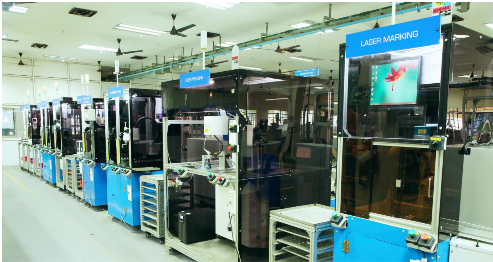
Oxygen Sensor Assembly Line