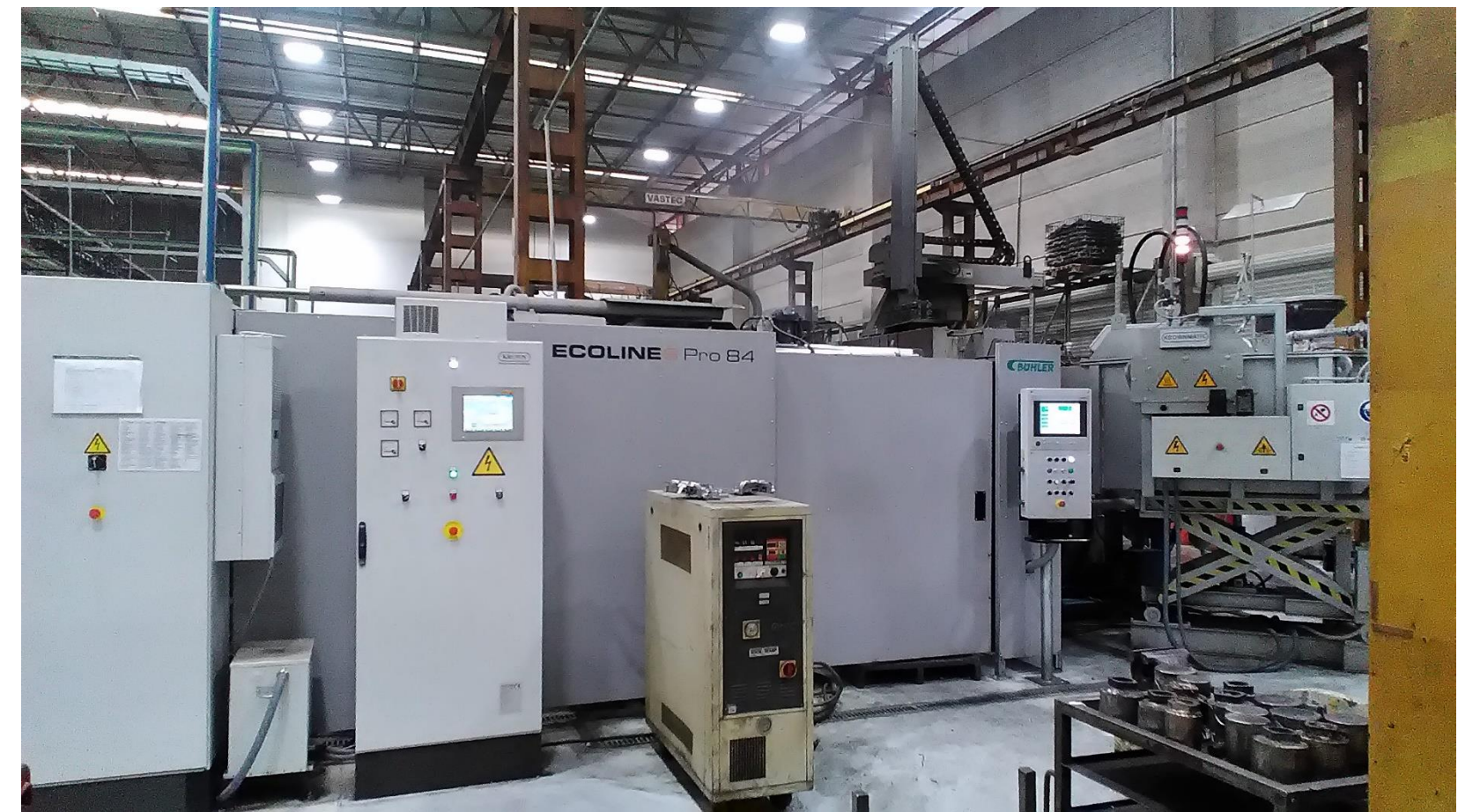
840T Die Casting Machine in Pricol do Brasil