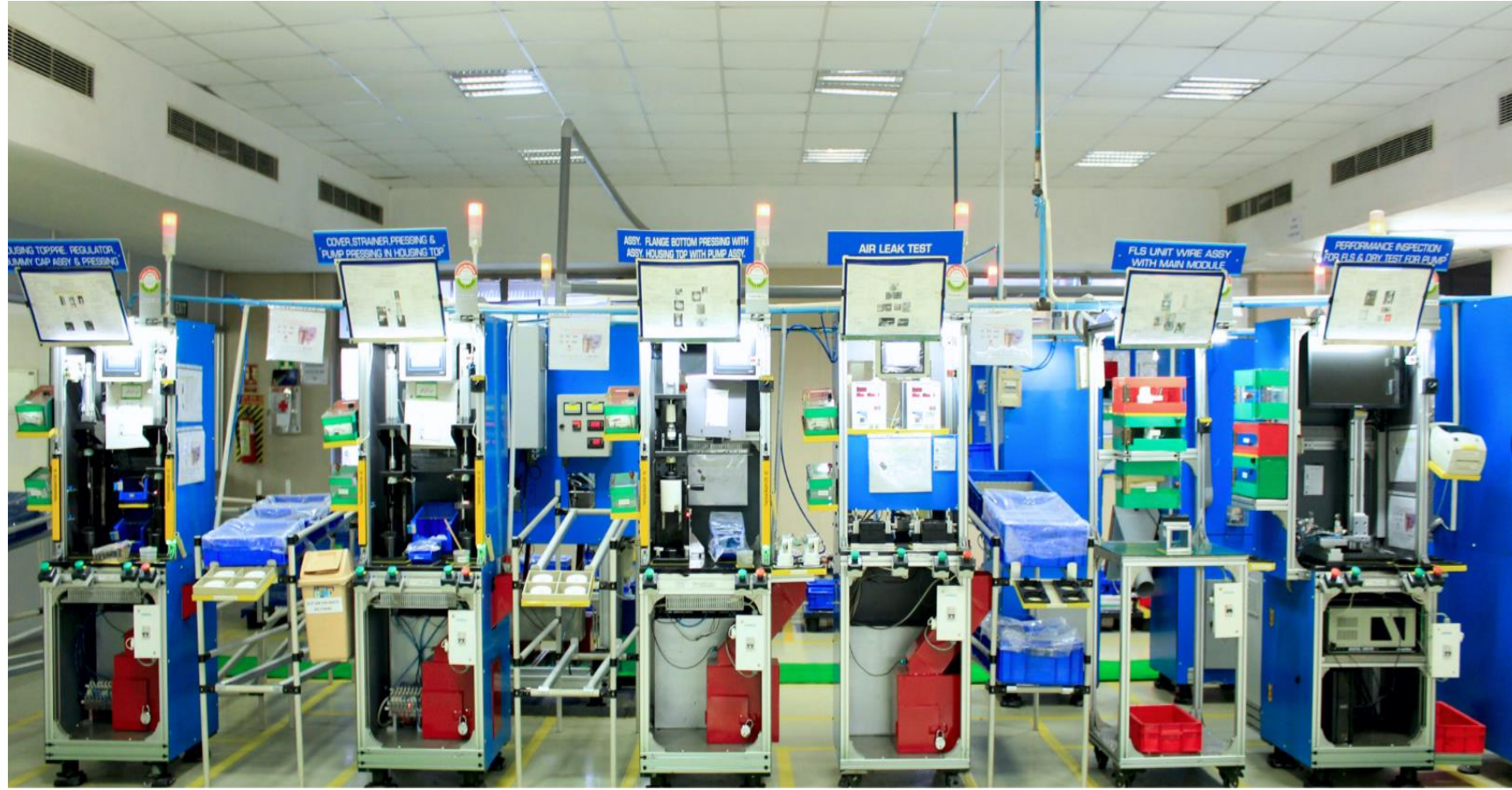
Fuel Pump Module Assembly Line in Plant 2