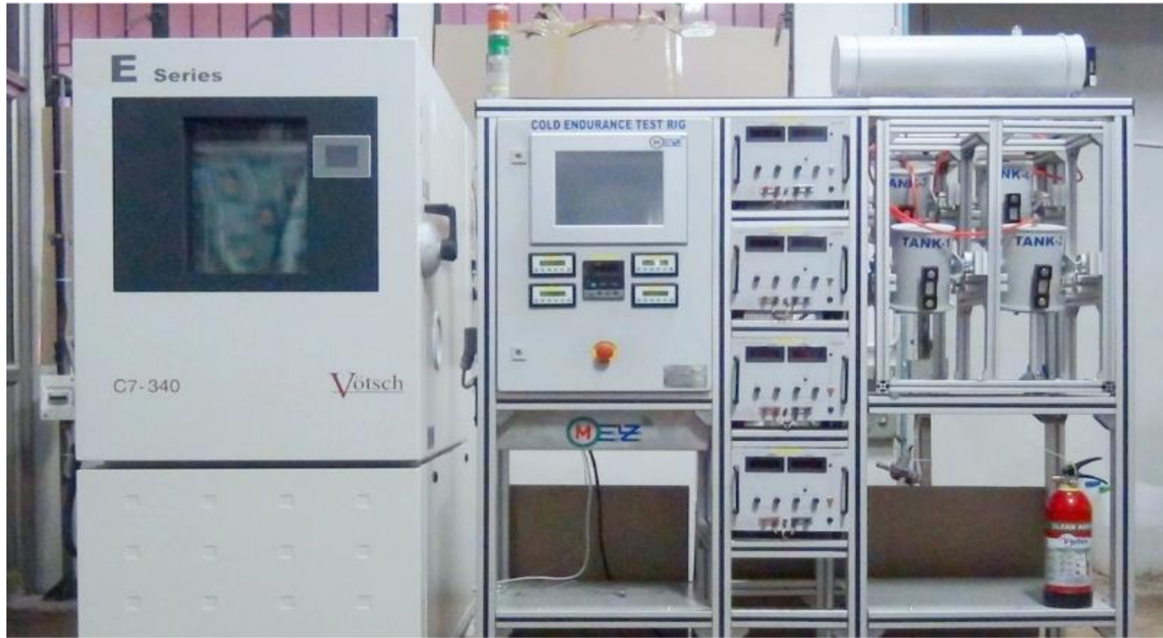
Endurance test facilities in Plant 1