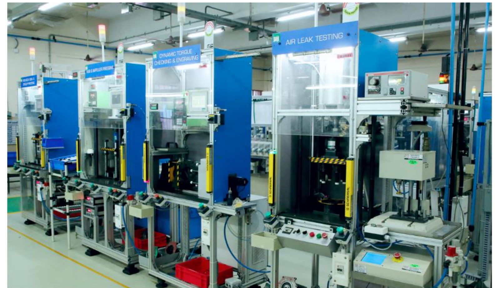
Semi-Automatic Four Stroke Oil Pump Assembly Line in Plant 3 for Ashok Leyland