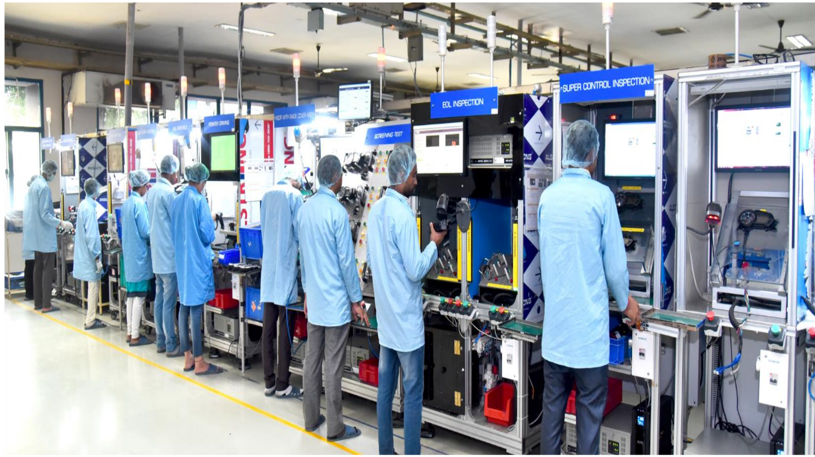
No Fault Forward Assembly Line for Electronic DIS