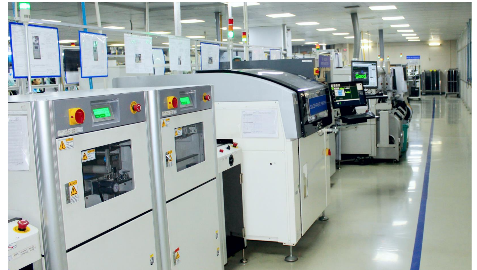
2 nd SMD line for PCB in Plant 2