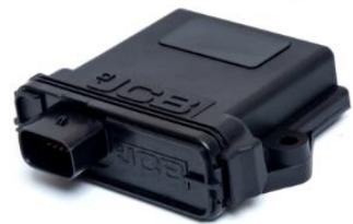
Low Cost Telematics Solution