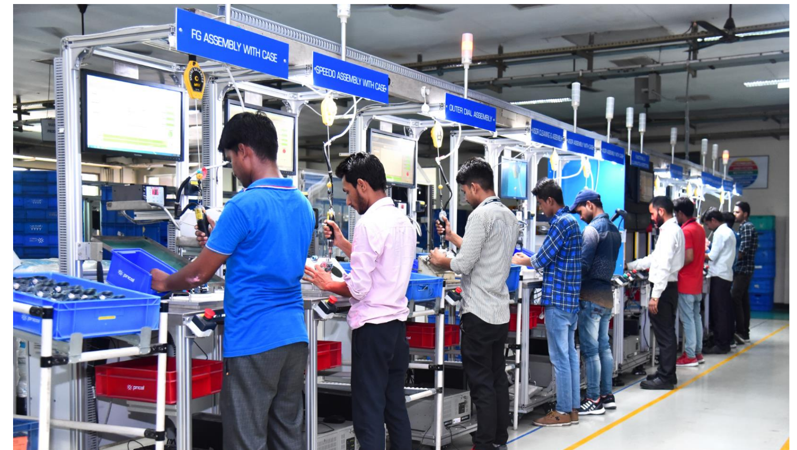
No Fault Forward Assembly Line for Mechanical DIS