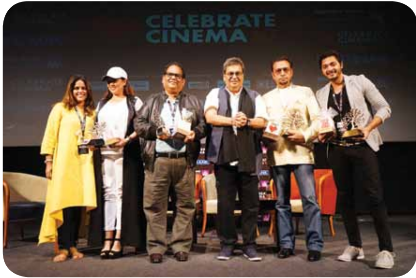
Celebrate Cinema at Whistling Woods International

The school continues to have the best of the best visit its premises for master classes and this year has been no different. In addition, the school continued its brand building with its hugely successful Celebrate Cinema initiative, which is a public event for all film buffs to come and learn from masterclasses and workshops; Saksham, which is a social cause oriented platform where this year the ills of social media stalking and cyber bullying were brought into focus and WWI also joined hands with the Forest Ministry of Maharashtra to produce a range of musical video's on tree plantation in the state.