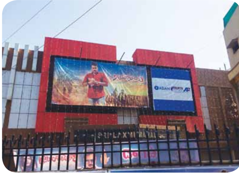
Mukta A2 Cinemas with South's Asian Cinemas

The company though did open new screens in its JV with Asian Cinemas in the Andhra region. The count in this JV now stands at 8 screens which are performing strongly given the access to top content from that region.