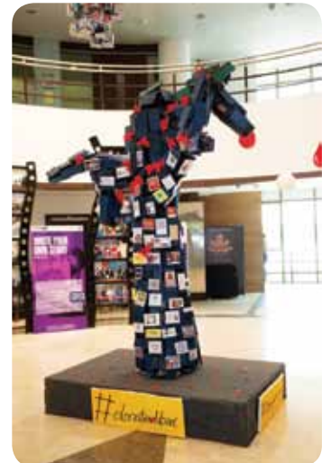
Blood Donation Camp at Whistling Woods International

WWI has joined hands with Reliance Jio to launch the WWI Virtual Reality Lab. VR / AR is expected to be the next major driver in the Media and Entertainment industry and WWI has taken the lead by looking to create the methodology to learn and deliver education in this area. The Lab will be producing content for Reliance Jio's Jio Cinema platform and experimenting with various filmmakers to push the boundaries of this technology in storytelling.