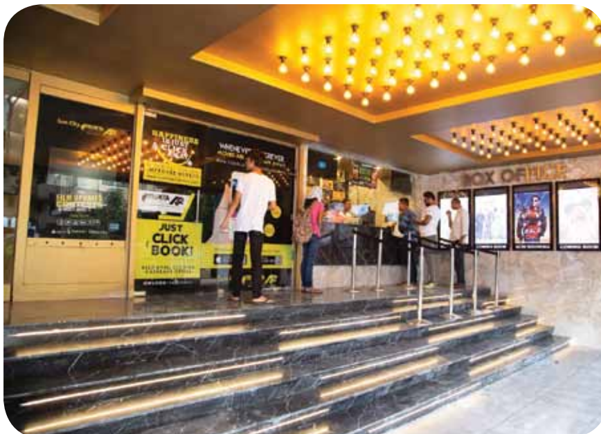
Suncity Mukta A2 Cinemas, Vile Parle, Mumbai

Screen count didn't grow as strongly as expected. The effects of demonetisation in the small towns and cities as well as a continued lack of retail infrastructure coupled with the GST rate on movie tickets continuing to be higher than other entertainment areas meant that many Exhibition companies used this year to consolidate into more high value areas as well as reposition theatres to build more segmentation.