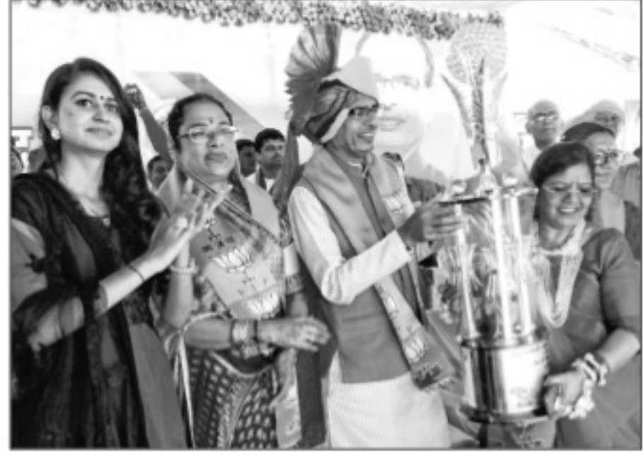
Bakaner

Chief Minister Shrivraj Singh Chouhan's jan ashirvad yatra arrived in Updi Umarbanjan on Friday to a grand welcome by residents.