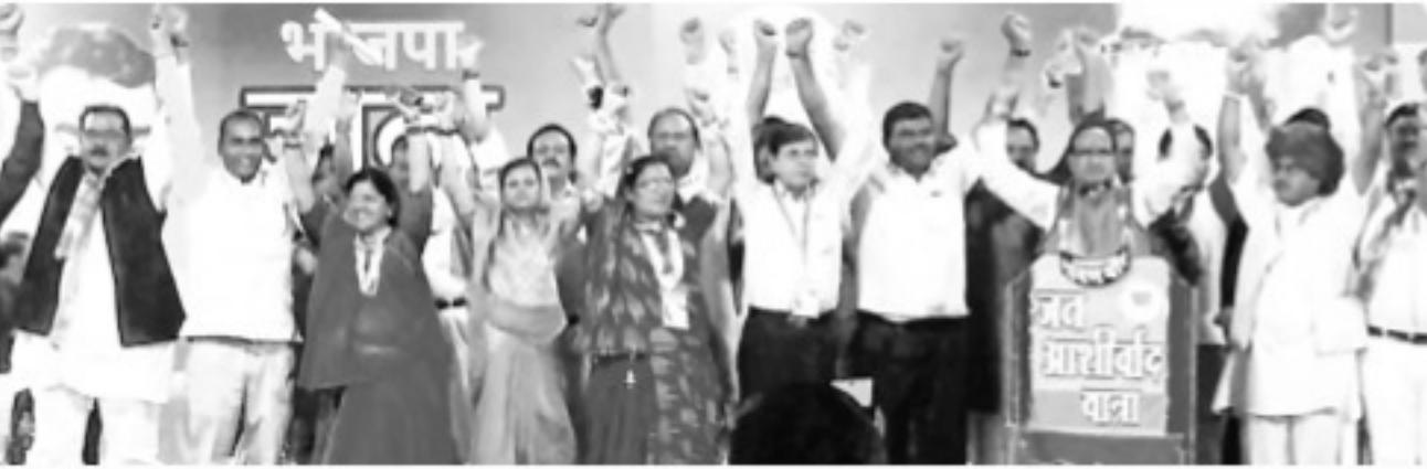
Rajgarh

Chief Minister's jan ashirvad yatra was welcomed in town on Friday with gusto.