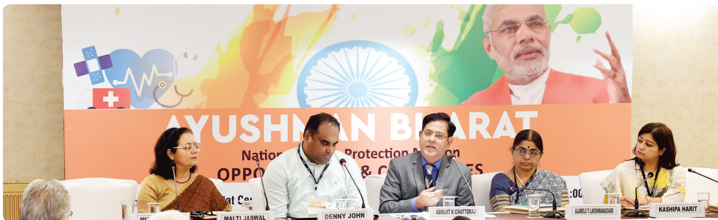
Dignitaries at the round-table discussion on Ayushman Bharat – National Health Protection Mission – Opportunities & Challenges, organised by Birla Institute of Management Technology (BIMTECH), at the India Habitat Centre in Delhi.