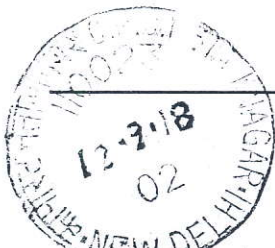
(Date Stamp of the Office Postal)

Handwritten calculations: 10469 and 230318 with lines underneath.